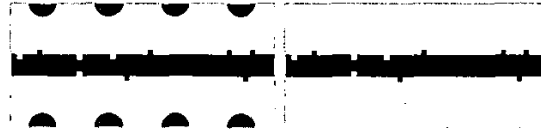
Figure 2: Closeup of central waveguide region, showing how identical surface roughness was added to both the photonic-crystal and index-guided waveguides.

For a photonic crystal waveguide based on a complete band gap, radiative scattering from disorder is impossible—there are no radiating states to scatter into at the operating frequency in the gap. One might wonder, however, whether this might have an unfortunate side-effect: perhaps some of the disorder-scattered light that would have otherwise radiated is instead reflected? Or, put in another way, a photonic-crystal waveguide is effectively a one-dimensional system (light can only propagate forward or backwards), and it is a known theorem of Anderson localization that any amount of disorder in one dimension causes all states to be localized—this might seem to imply that disorder-induced reflections are worse in one-dimensional systems. If reflection is indeed intrinsically worse in a photonic crystal, this would be a serious problem for optical devices (which are more sensitive to reflection than to loss, because the former produces noise).